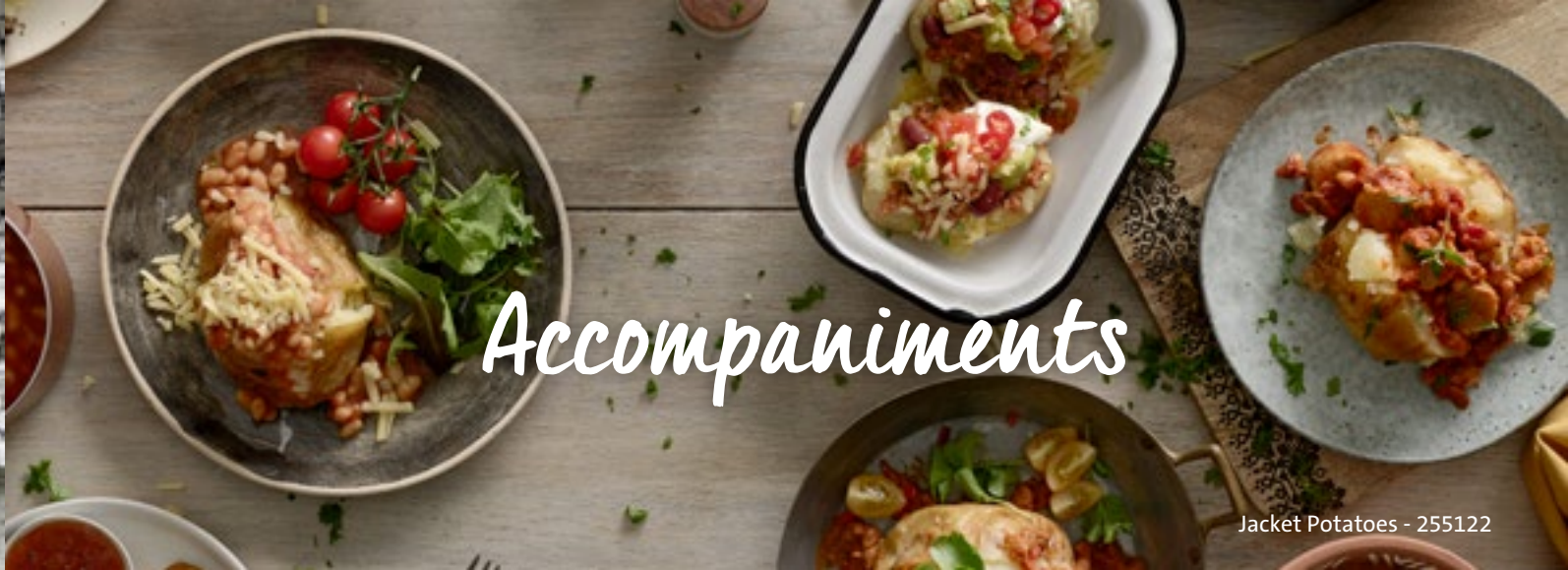
Jacket Potatoes - 255122