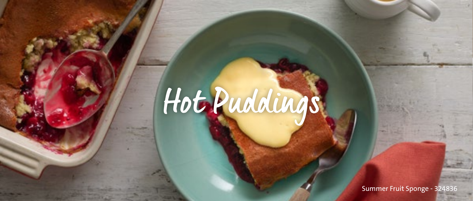
Summer Fruit Sponge - 324836