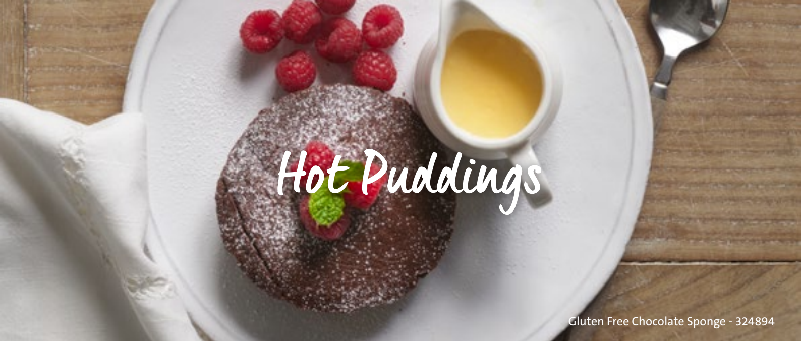
Gluten Free Chocolate Sponge - 324894