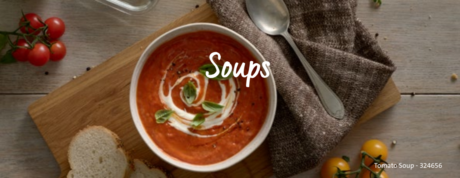
Tomato Soup - 324656