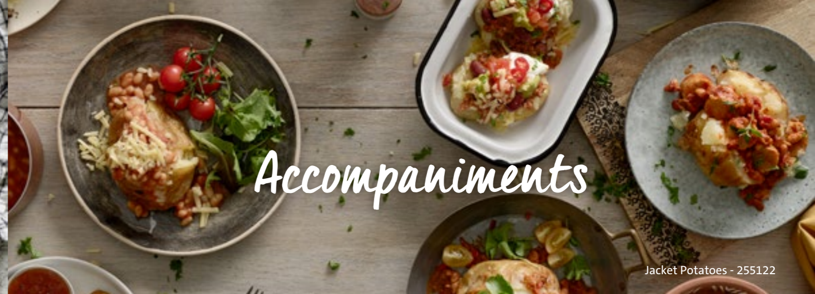
A selection of side dishes