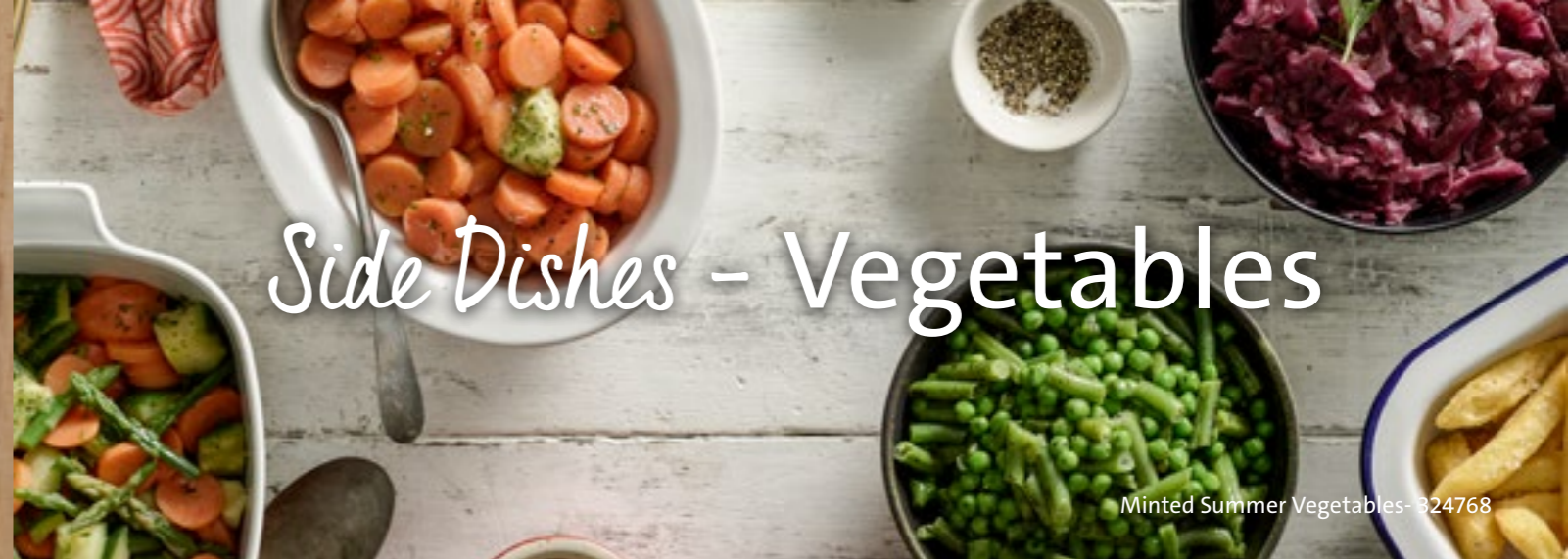
Minted Summer Vegetables- 324768