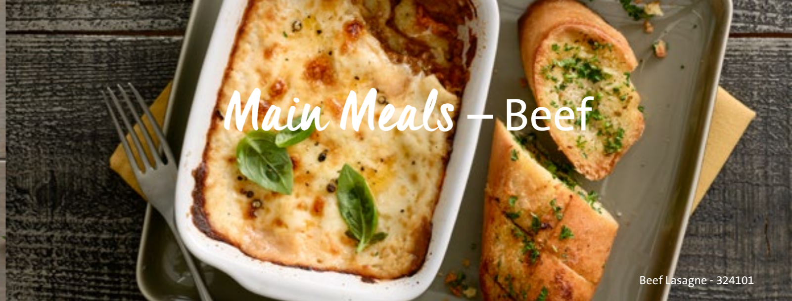
Beef Lasagne - 324101