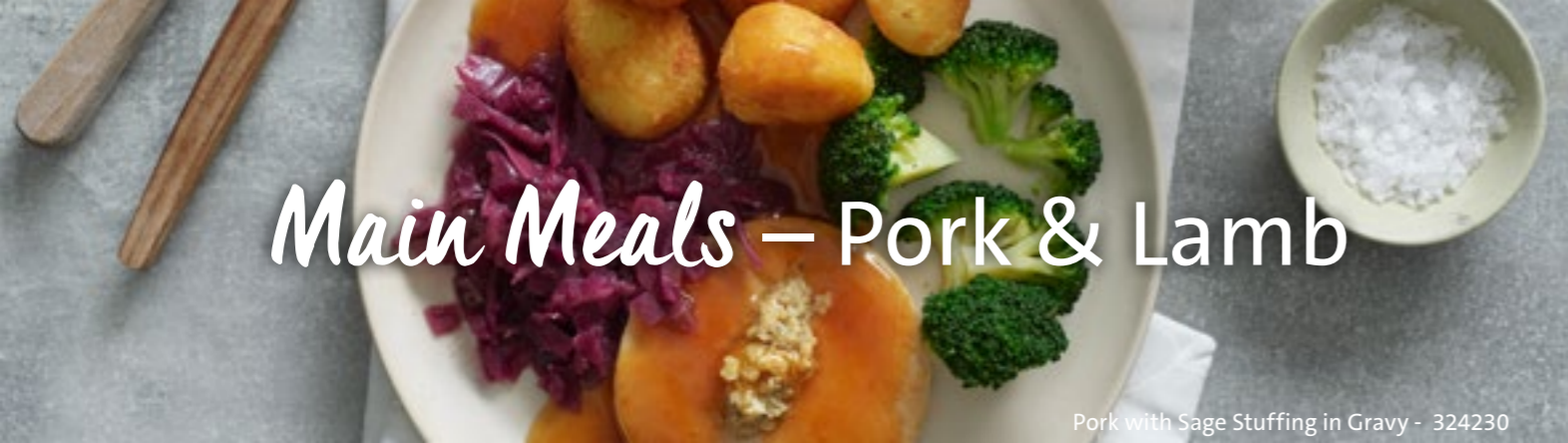
Pork with Sage Stuffing in Gravy - 324230