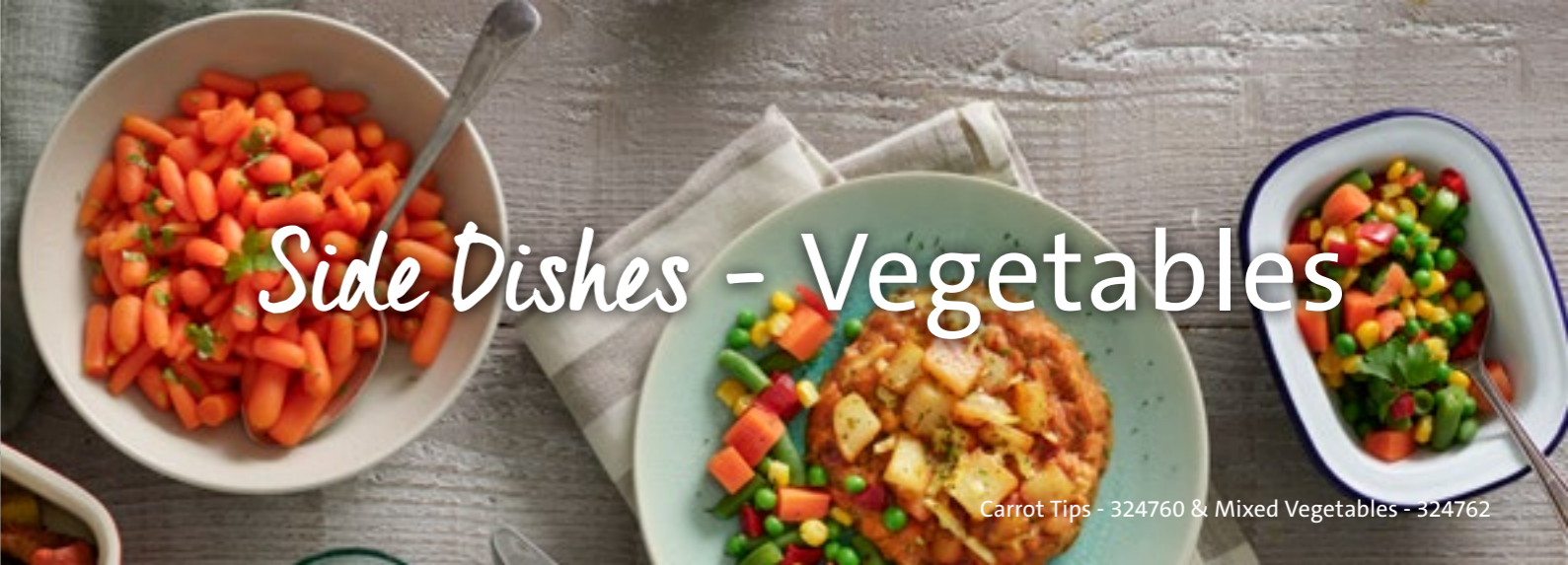
A Vegan/ Vegetarian Group Shot