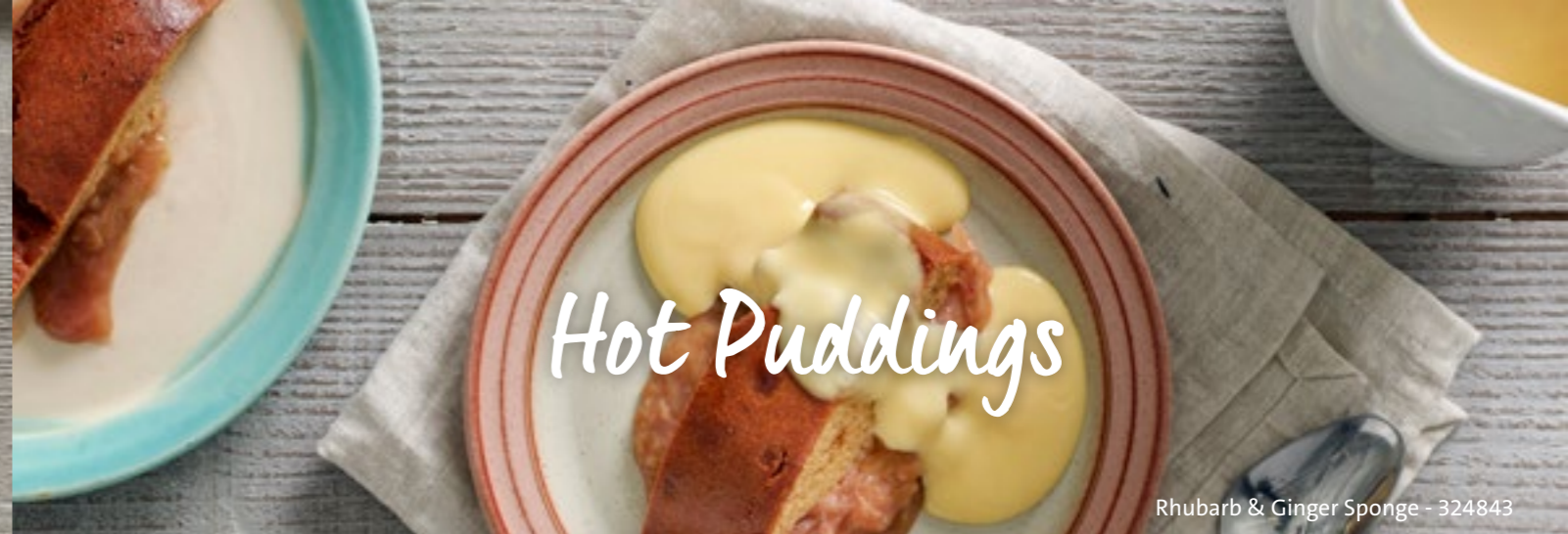
A Selection of Hot Desserts