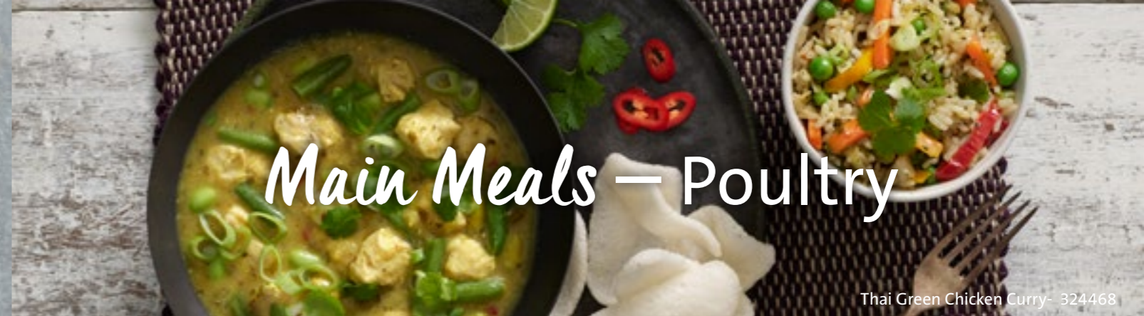
Thai Green Chicken Curry- 324468